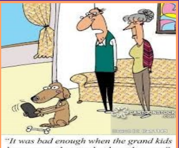
knew more about technology than me.

Positive and Negative Impacts of Media on M&T